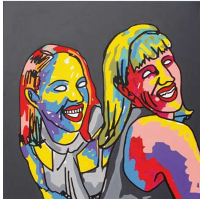
Left: Coloured People #33 , 2008, acrylic on linen, 101 x 101 cm Coloured People #35 , 2008, acrylic on linen, 101 x 101 cm Flap: Coloured People #29 , 2008, acrylic on linen, 101 x 101 cm Coloured People #31 , 2008, acrylic on linen, 101 x 101 cm